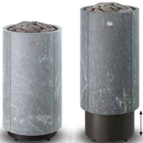
KAARNA L CLASSIC

DATA LIST. Electric heater KAARNA L For more information see manual